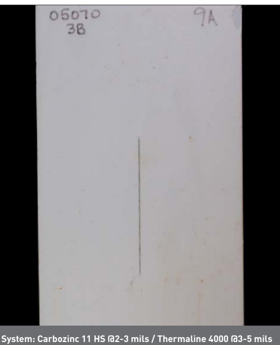
System: Carbozinc 11 HS @2-3 mils / Thermaline 4000 @3-5 mil Exposure: Salt Fog (ASTM B117); 5000 hours exposure